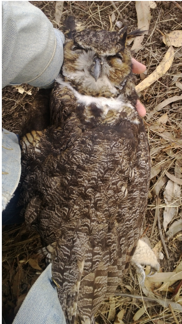
Blinded Great Horned Owl