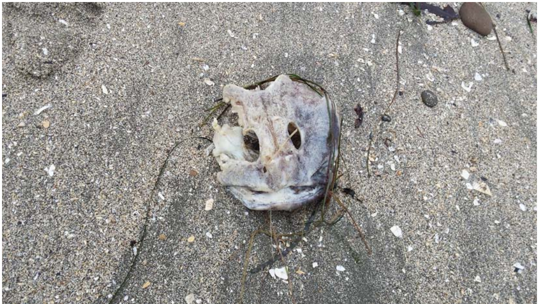
Greek Fish Head